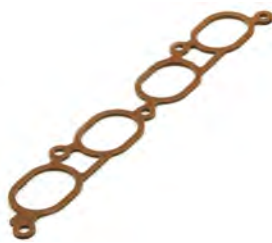
THERMAL COMPOSITE GASKET